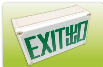
"CRYSTALITE" Cat. CX-LED-150-B-WL(175)