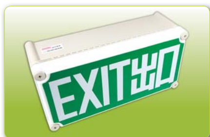
"CRYSTALITE" Cat. CX-LED-150-B-WL

Surface mounted, self-contained, maintained type, super bright white LED exit sign box with automatic changeover device for 3 hours emergency battery discharge.